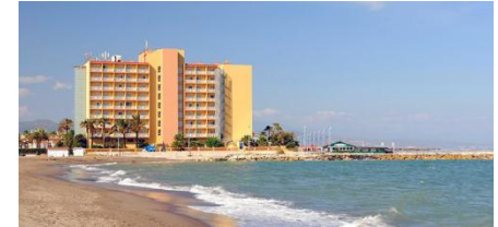
Hotel Tryp Guadalmar 4*